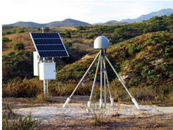
The OCRTN CORS site, "WHYT" was installed in June 2001.

There were two main objectives of the OCRTN project. The first objective was to streamline high-rate raw GPS data at a 1-second rate with low latency (less than two seconds) from the CORS sites to a system of computers configured to collect the data located at the Geomatics Division office. From there, the raw GPS data could be accessed by CSRC, SCIGN, and any other requested users. This computer system would archive the 1-second raw GPS data files and generate 15-second RINEX files. The second objective was to generate and make available RTK corrections using the standard Radio Technical Commission for Maritime Services (RTCM) data format (message types 3, 18, 19, 22) to anyone at no cost for RTK surveying and dynamic positioning in Orange County. This would mean that anyone with the proper equipment could use this data for real-time precise positioning.